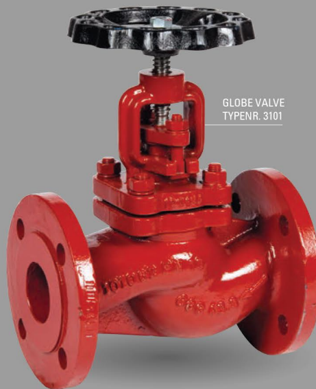
GLOBE VALVE TYPENR. 3101