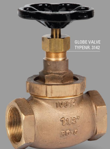
GLOBE VALVE TYPENR. 3142