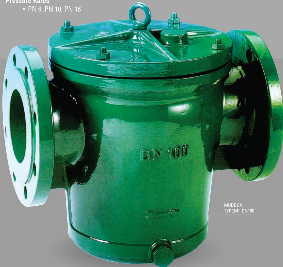
MUDBOX TYPE NR. DN100